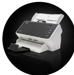
Alaris S2050/S2070 Scanners