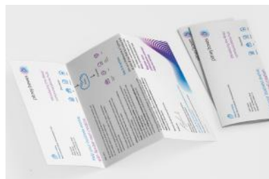
Fold-only function Machine fold your brochures and flyers for letterbox or promotional distribution.