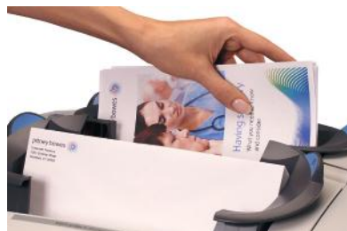
Insert feeder Add impact to your mail piece with a pre-folded brochure, notice or reply envelope.