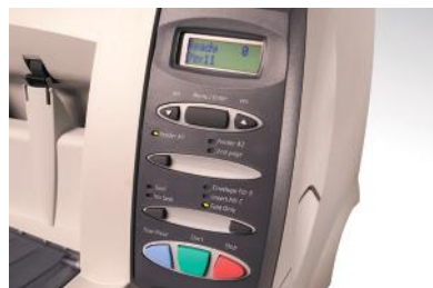
Control panel The simple interface makes job selection easy. Just press and go.