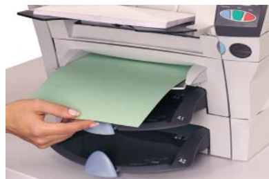
Convenience feeder Give everyday mail a professional look by feeding up to 3-pages stapled or unstapled.