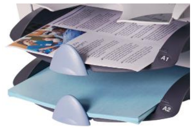
Sheet feeders Load up to 160 sheets using the optional second sheet feeder.