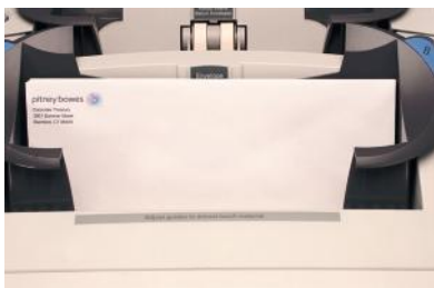
Envelope feeder Large envelope capacity envelope capacity also lets you load material on the fly for continuous operation.