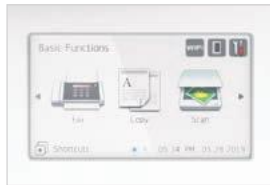
bizhub 4020i 3.7-inch touch panel