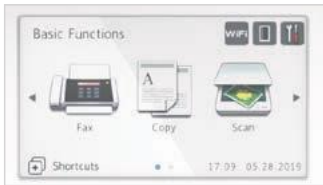
bizhub 5020i 4.84-inch touch panel

The large colour LCD touch panel is easy to operate even for first-time users. An intuitive interface and smartphone-like operability helps you get to the functions you need quickly, with no fuss.